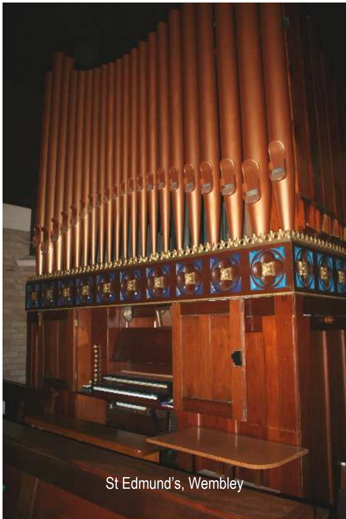
St Edmund's, Wembley